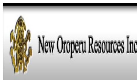
New Oroperu (ORO.V)