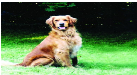
Metalore Resources (MET.TO)